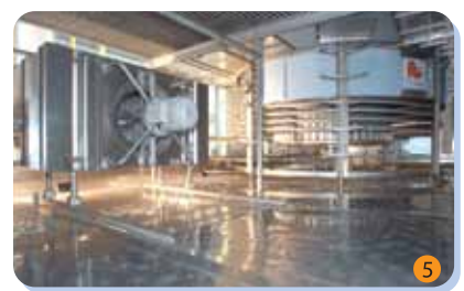
Double impingement crust freezing fan unit