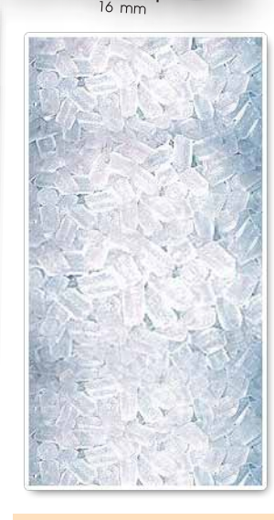
Figure 2 Uniformly clear ice size produced by TIM Series Tube Ice Maker