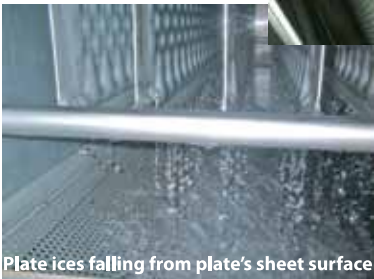
Plate ices falling from plate's sheet surface

ITC's Dynamic Plate Ice Maker is one of the most exquisite, extreme and extraordinary ice making units we have ever made. This ice maker is designed to build tons of flake ice along the falling film plate sheet. It is extensively employed in various industries, commerce, food processing and many more.